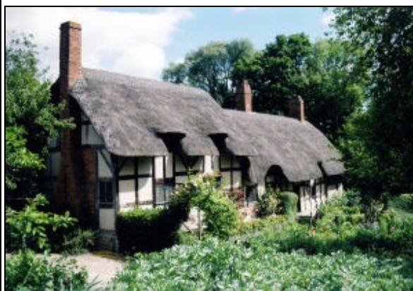
Ann Hathaway's cottage where the young Shakespeare wooed his wife to be.

Rotary's hotel reservation form includes five hotels in nearby Stratford-upon-Avon. The Rotary Convention bus connects you to the Birmingham convention hall. Let William Shakespeare, the greatest writer in the English language and the world's preeminent dramatist inspire your youngsters. Book extra days before or after the convention to take the Shakespeare tour ranging from Ann Hathaway's cottage where the young Shakespeare wooed his wife to be, including Hall's Croft home of Dr. John Hall and his wife Susanna (daughter of William Shakespeare and Ann Hathaway), and see the graves of the Bard and his family members. For tickets to Shakespearean plays, go to: rsc.org.uk . What's on gives Royal Shakespeare Company's June 2009 performances in Stratford-Upon-Avon. If next summer's schedule is not yet posted, see an example of when and where Shakespeare's works are performed.